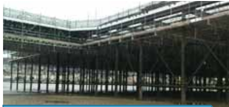
MPI, Ultrasonic and Material Evaluation of pier structure

Welder training and certification, weld procedure approval with or without third