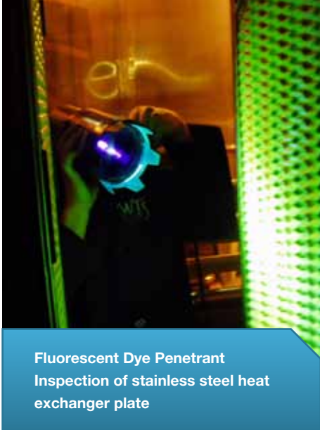
Fluorescent Dye Penetrant Inspection of stainless steel heat exchanger plate