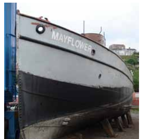
Ultrasonic Thickness Survey and Material Evaluation of a tugboat

carried out on site utilising the colour contrast method or in its laboratory using the fluorescent method.